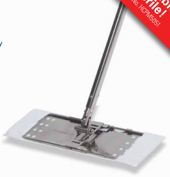
Pocket design allows for quick attachment to hardware, making the Contec MicroCinch Mop a better alternative for efficient, quick cleaning.

The “pocket” style design allows for quick changing of mop pads and the autoclavable, collapsible mop head frame, available in heavy duty plastic or stainless steel, easily snaps into the pad pockets. Contec’s MicroCinch Mop is the ideal solution for daily cleaning and disinfecting of Secondary Engineering Controls required in pharmacy environments. Cleanroom packaged for guaranteed quality and cost effectiveness. Available gamma irradiated. Validated sterile to a Sterility Assurance Level of 10 -6 per AAMI ISO11137 Guidelines.