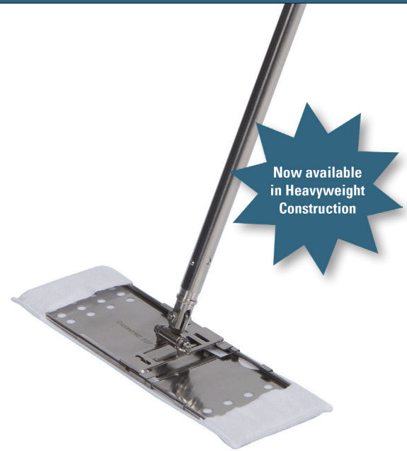
Pocket design allows for quick attachment to hardware, making the Contec MicroCinch Mop a better alternative for efficient, quick cleaning. See part details for Heavyweight construction.

The “pocket” style design allows for quick changing of mop pads and the autoclavable, collapsible mop head frame, available in heavy duty plastic or stainless steel, easily snaps into the pad pockets. Contec’s MicroCinch Mop is the ideal solution for daily cleaning and disinfecting of Secondary Engineering Controls required in pharmacy environments. Cleanroom packaged for guaranteed quality and cost effectiveness. Available gamma irradiated. Validated sterile to a Sterility Assurance Level of 10 -6 per AAMI ISO11137 Guidelines.