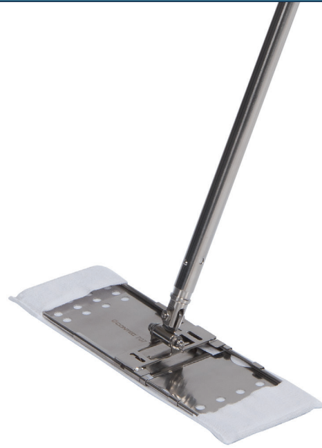
Pocket design allows for quick attachment to hardware, making the Contec MicroCinch Mop a better alternative for efficient, quick cleaning.

The “pocket” style design allows for quick changing of mop pads and the autoclavable, collapsible mop head frame, available in heavy duty plastic or stainless steel, easily snaps into the pad pockets. Contec’s MicroCinch Mop is the ideal solution for daily cleaning and disinfecting of Secondary Engineering Controls required in pharmacy environments. Cleanroom packaged for guaranteed quality and cost effectiveness. Available gamma irradiated. Validated sterile to a Sterility Assurance Level of 10 -6 per AAMI ISO11137 Guidelines.